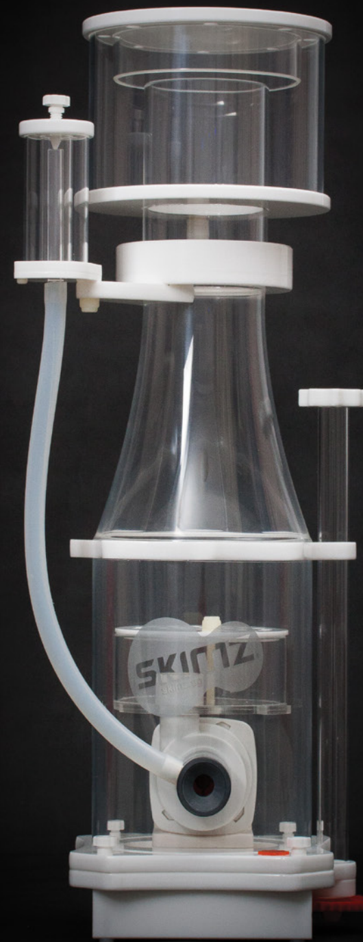
MONZTER Skimmer 3rd GEN